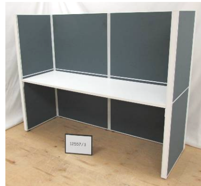
Straight single unit 1