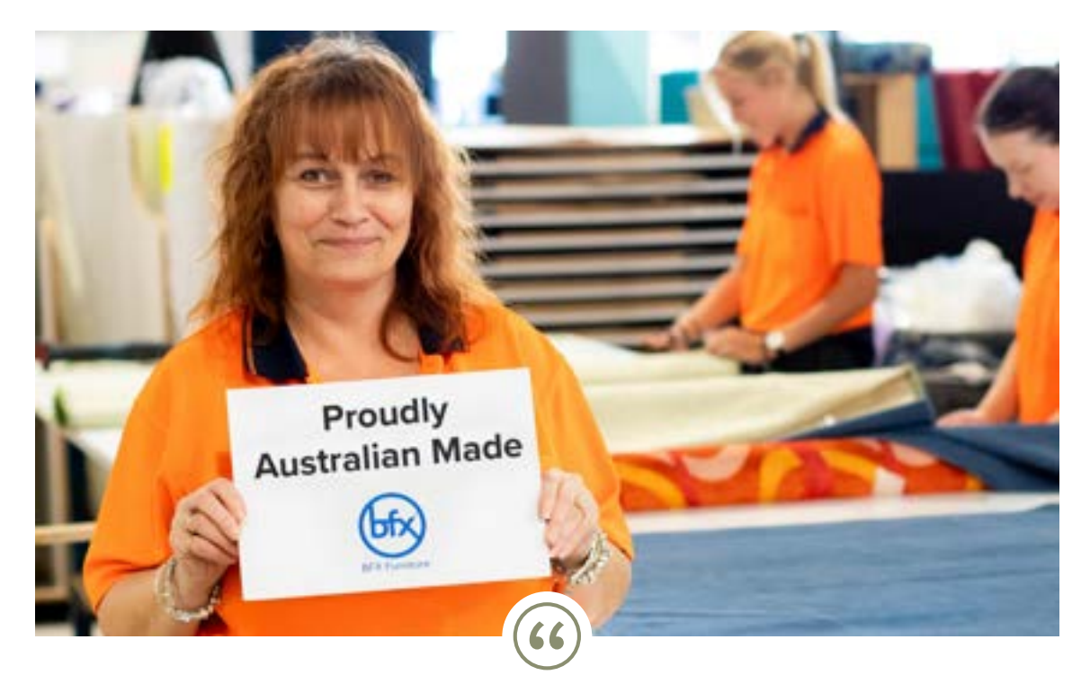
"Together, we celebrate diversity, we salute success, and we always look to do better."

At BFX, five, ten, 15 and 20 years' service is common. Second generation BFX employees are not uncommon.