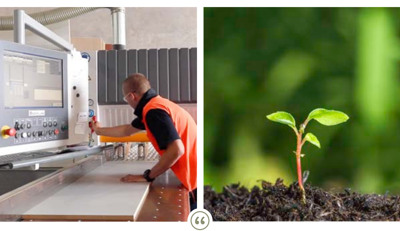
"Our goal is to forever enhance the social, environmental, and economic sustainability of our business – and to be at the forefront of our industry's efforts to reduce its impact on the environment."